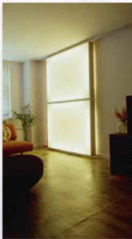
TOP: a 2m luminous sculpture of fluorescent light and layers of handmade paper - as used at the Negri Village restaurant and lounge, New York City LEFT: a 3m high movable light wall made of fabric and wood which softly infuses ambient light

esperi... consigli... di clienti a fronte... di Milka Cudina... della sua avventu... tra i suoi amici