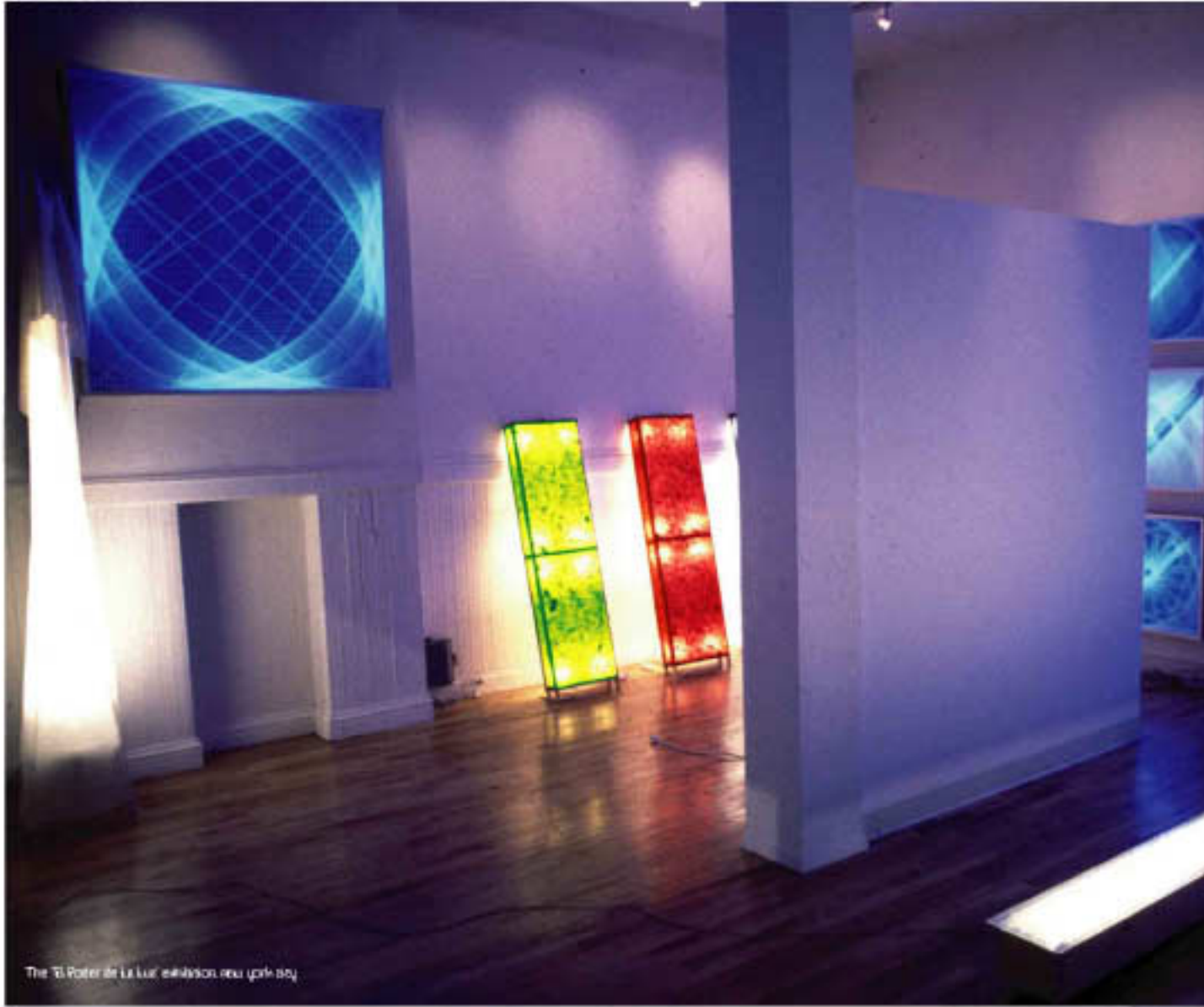
The "El Poder de La Luz" exhibition, New York City