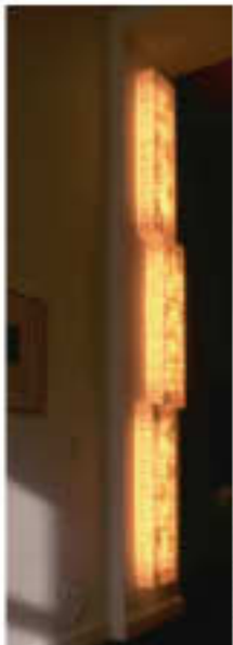
FAR LEFT: the 'Synchron Series' of light boxes LEFT: the 'Light Column' RIGHT: 'Eleven', the twin light sculptures